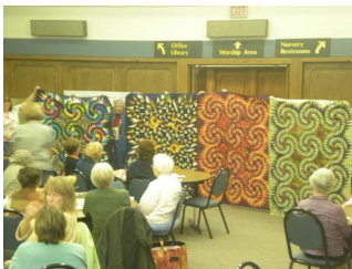
Paper Pieced Quilts from a KQ small group September Meeting, 2009